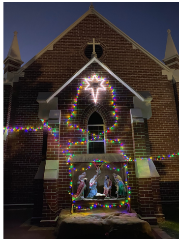
Our Lady's Assumption Catholic Church