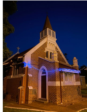
St Peter's Anglican Church