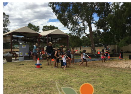
Basketball at the Brunswick Recreation Centre Water fun day at the Community Centre