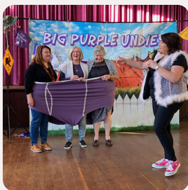
PAGE 10 THANK A VOLUNTEER DAY