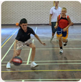
PAGE 2 HOLIDAY FUN