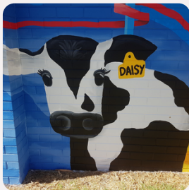
PAGE 4 BRUNSWICK'S LATEST MURAL