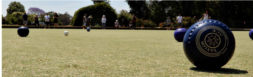
Beela Valley residents value the connection with Brunswick Bowling Club members during their weekly game.

We are all looking forward to 2021 and a new year of reaching goals, healing and recovery at Beela Valley TC, and we take this opportunity to thank everyone in the Brunswick community for their support.